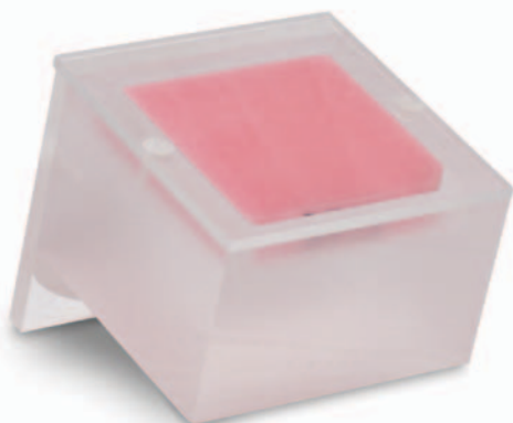
Phantom with image evaluation insert

In the past, there was not an easy way to compare the image quality of conventional and digital biopsy mammography units because the field of view on the digital system is typically much smaller than the 24 cm x 30 cm field of view on conventional mammography units. In order to image the Mammographic Accreditation Phantom specified by the American College of Radiology (ACR) on the biopsy units, the user has